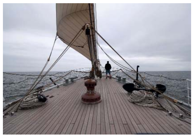
Look-out.

Further information regarding what to bring along will be sent to you either online or by mail after registration. Christian Radich's handbook can either be downloaded or you can ask the office to send it to you. The handbook describes life on board a tall ship and we recommend it for new trainees.