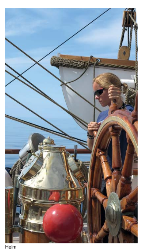
Vind in the sails