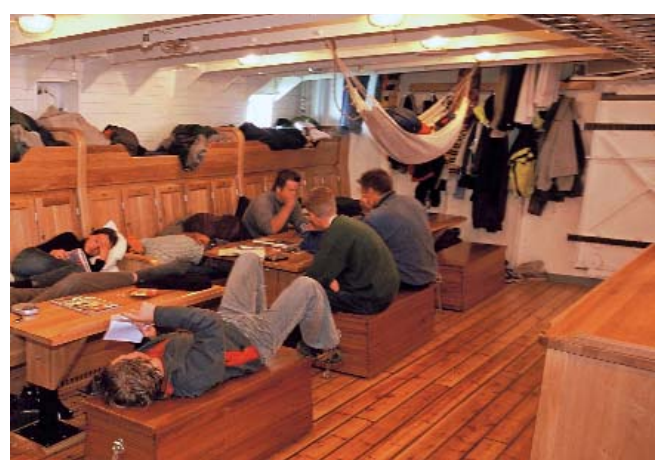
On lower deck.